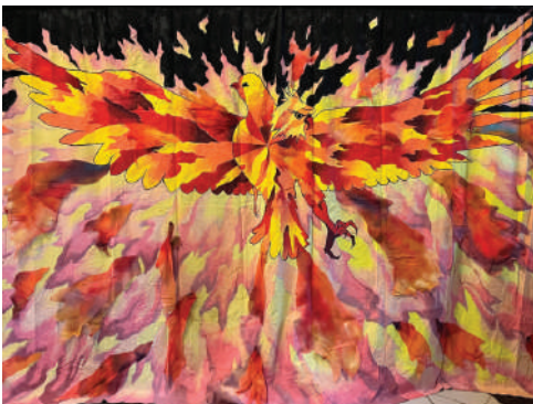
Ed - Eagle and Dove