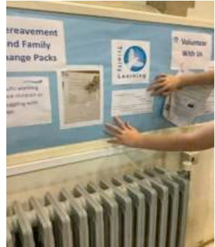
John Mason students busy updating our display in Trinity Church

we hope several more will get the opportunity before the end of term.