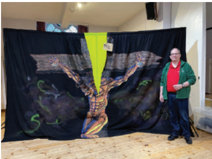
Hinri - Jesus of Nazareth King of the Jews (INRI) - shown at Thursday Group May 2024