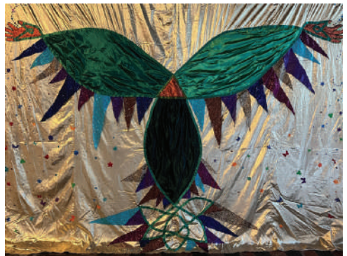
Favokes - Christ is alive and the universe must celebrate