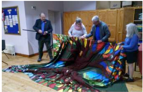
Putting away a hanging - Thursday Group 2021