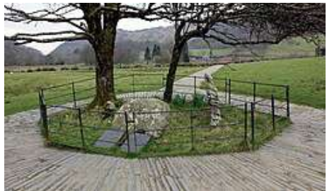
Gelert's Grave in 2012