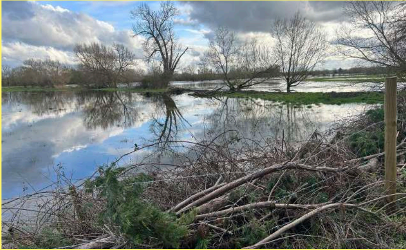
Floods on the River Thames, Abingdon